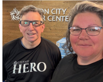
Roper's Heating and Air Conditioning & Harrah's/Harveys Casino Employees for their fan donation

A24 | Saturday, June 20, 2026 | Nevada Appeal