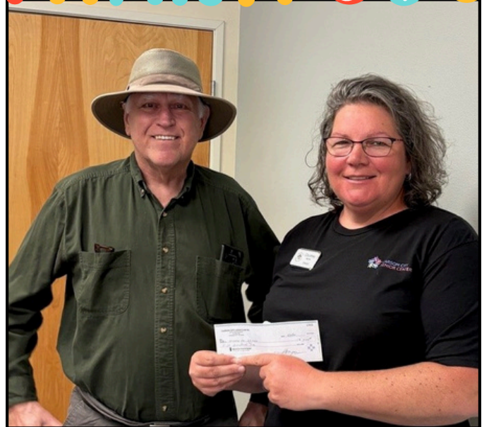
Carson City Lions Club donation of $500 to Meals on Wheels